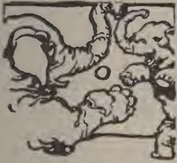
The Elephants Played Ball.

OF course it was very natural that Jack and Evelyn should enjoy every holiday that came along. But daddy wanted to tell them how the elephants in the zoo were planning to spend Decoration day.